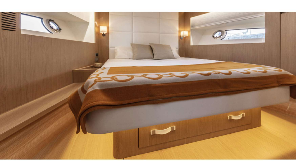
Guest's cabin Wood: Oak std