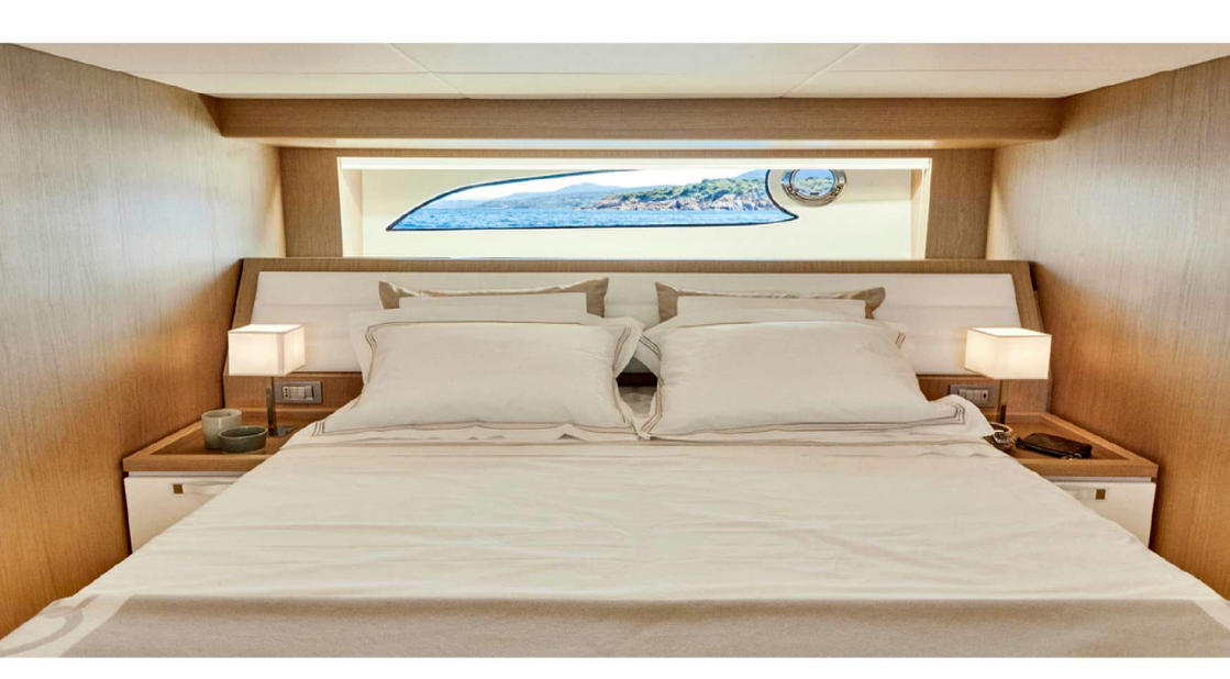
Owner's cabin Wood: Oak std

SolarisPower 55 has different interior layouts , to satisfy the wants of the most exacting of Owners