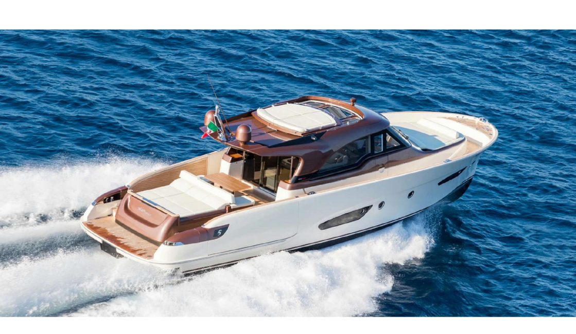
Hull - Deck