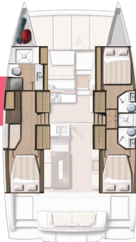
Owner's version 3 cabins and 3 baths Version propriétaire 3 cabines / 3 sdb